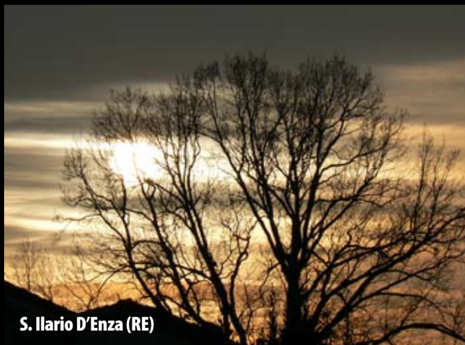
S. Ilario D'Enza (RE)

camera doppia 50€ - camera singola 34€ - camera tripla 60€